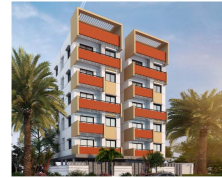
ASPIRA @ Isnapur, Hyderabad.