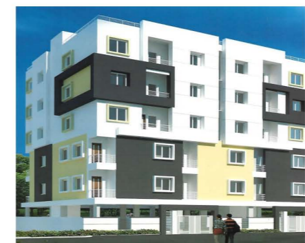
MPH WILLOW TRI @ Isnapur, Hyderabad.