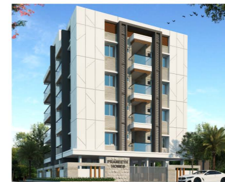
MPH WHITE ROCK @ Isnapur, Hyderabad.