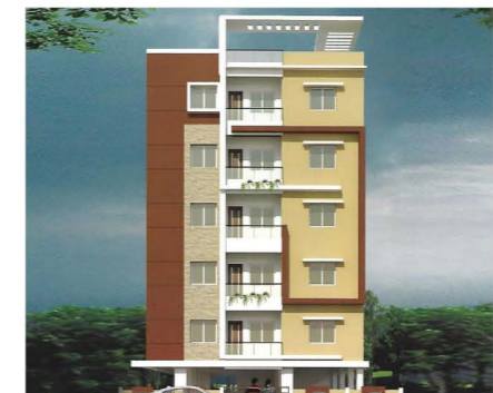
MPH WILLOWISH @ Isnapur, Hyderabad.