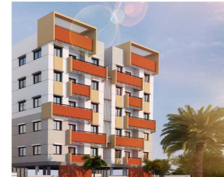
WONDUR @ Isnapur, Hyderabad.