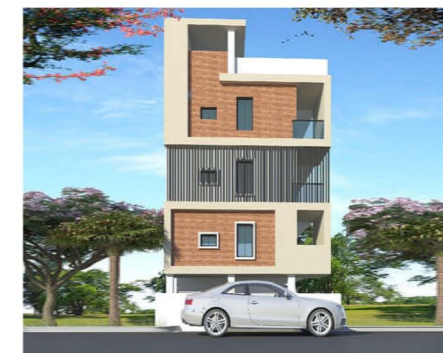
INDEPENDENT HOUSE @ Isnapur, Hyderabad.